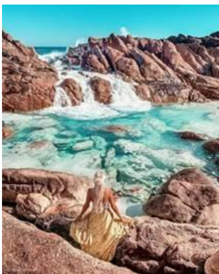
( @westernaustralia , @gypsylovinlight )

Tucked away on the edge of the Indian Ocean, Injidup Natural Spa is a natural rock formation that has quickly become a South West visitor staple. As waves crash over the rocks, a small natural waterfall forms that serves as the perfect shelter for a dip in the icy cool, crystal clear water. Visit at sunrise or sunset during golden hour for a true WA icon – as the sun puts on a spectacular light show moving over the water. Perfectly positioned along the Cape to Cape track, join a self-guided Cape to Cape Explorer Tour so you can relax leisurely at your own pace.