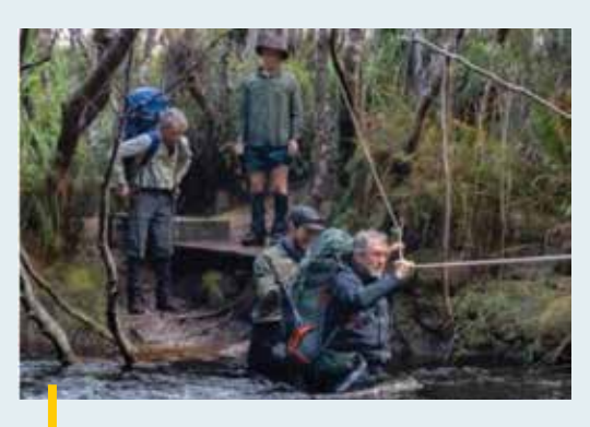
Creek crossing.