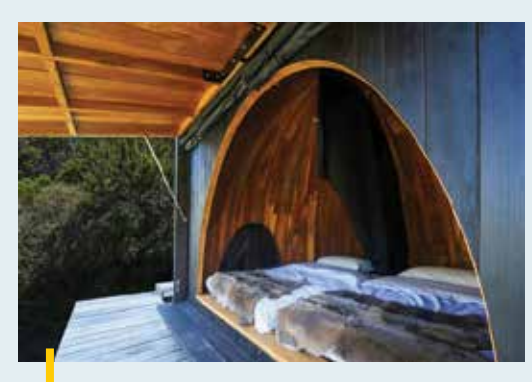
Domed ceiling huts.